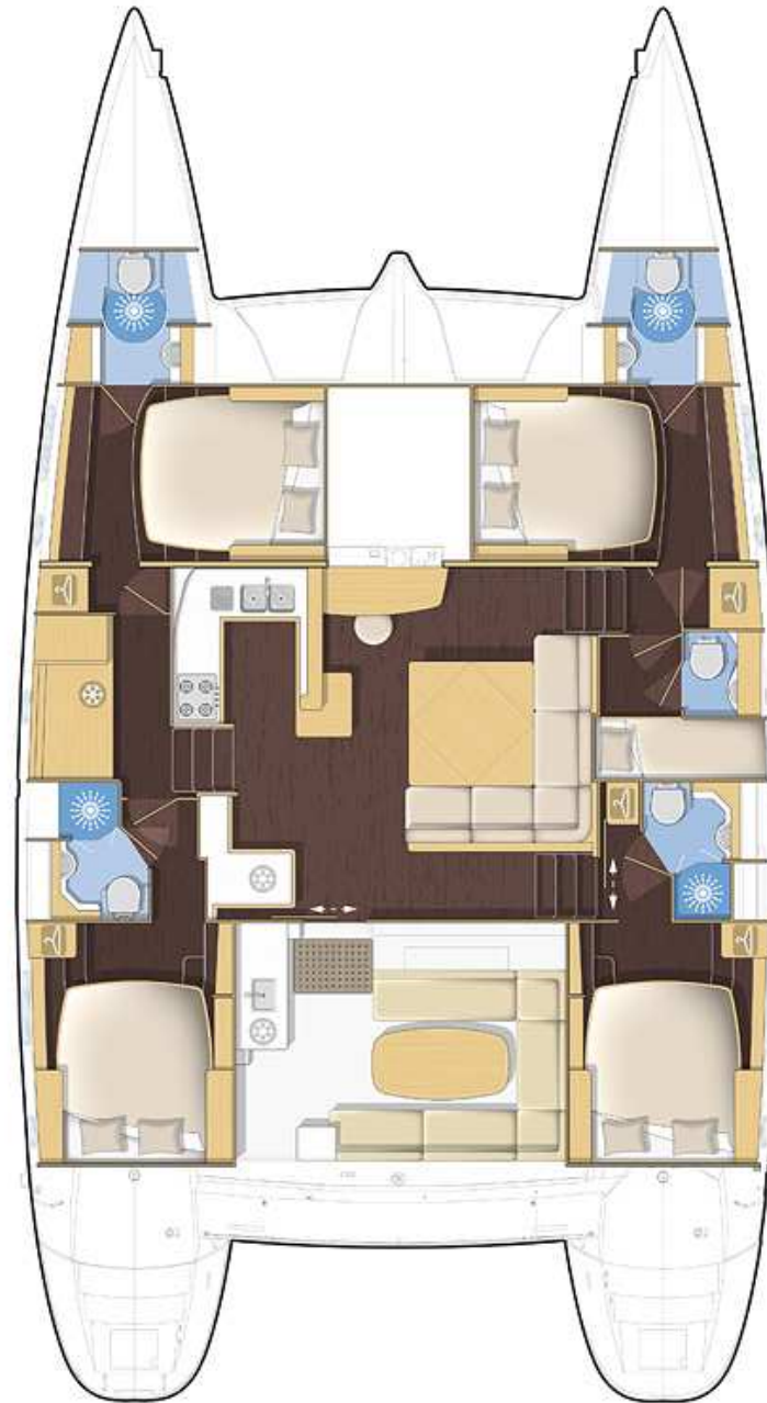
Version 5 cabins / 5 cabin version

Dinghy with hard bottom & outboard motor, Floating mats, tubes, Kayak, snorkel gear, windsurf*, underwater lights for night swimming